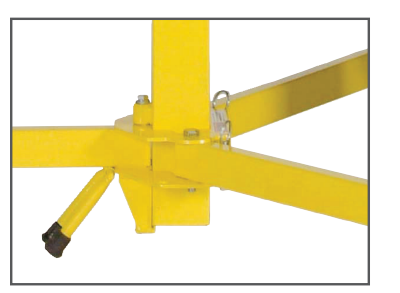
Back stop brake prevents lift from backing up while unloading drywall panels